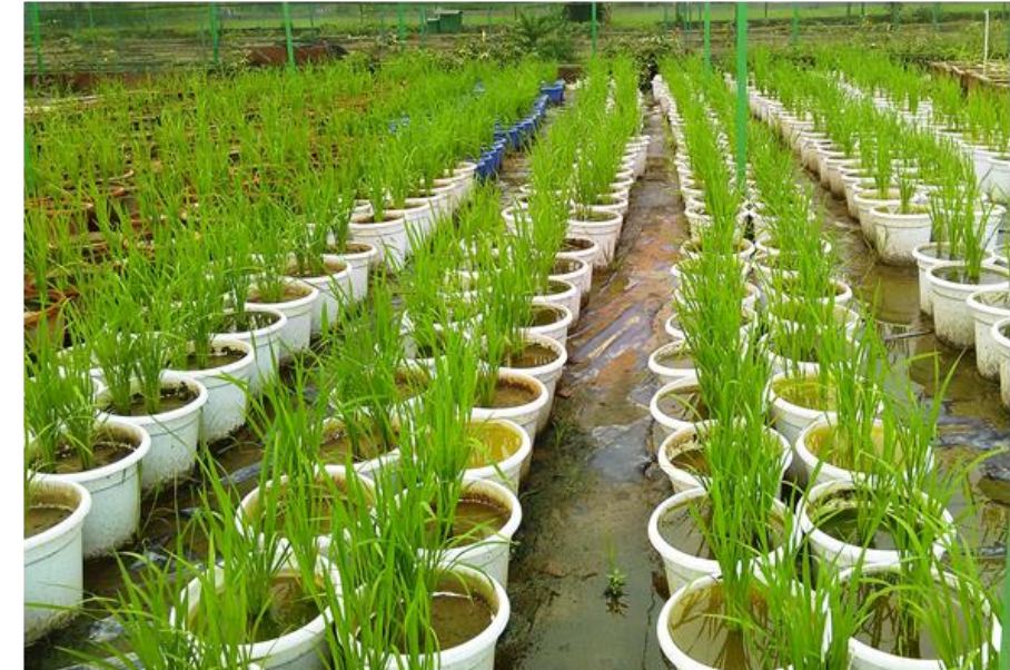
Rice plants at maximum tillering stage