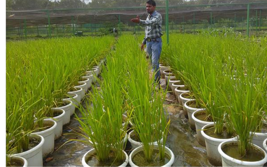
Rice plants at anthesis stage