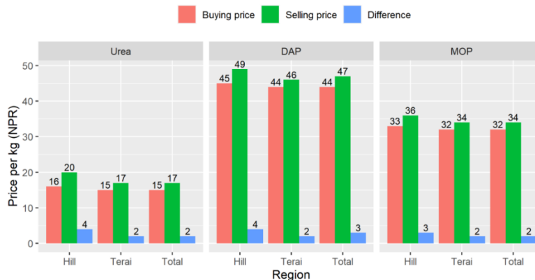
Figure 3. Average buying and selling price and difference by region (in NPR/ kg). The cooperatives in provinces further away from Birgunj tend to sell at higher prices than those closer to Birgunj. The average price paid by farmers in different provinces ranged from NRs 16-21 per kg for Urea, NRs 45-50 for DAP, and NRs 33–37 for MoP, respectively. The average price of all three subsidized fertilizers was highest in the Karnali province and lowest in Province 1 and Madhesh.

The Urea, DAP, and MOP prices in Birgunj port (port of entry in Nepal) were NRs 14, NRs 43, and NRs 31, respectively (Fig. 3). Each cooperative calculated its retail price based on transportation and logistics costs. The farmers in the hills paid more, primarily due to the added cost of transportation (from regional depots of AICL and STCL to distribution locations).