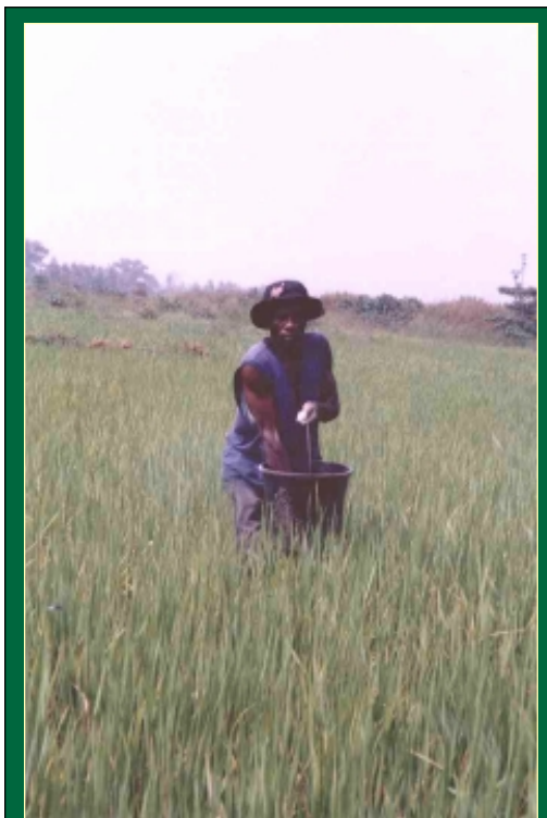
Photo of Togolese farmer